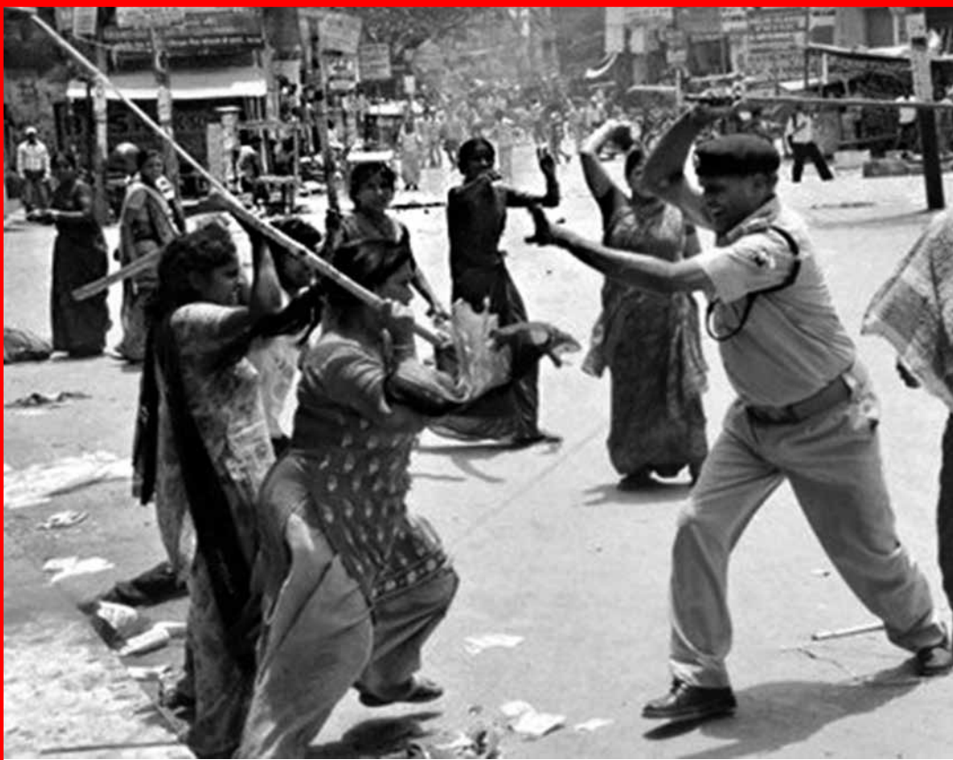
Women workers battle police during an anti-rape demonstration. Men and women workers must unite to abolish sexism.

All of the struggles are divided with no revolutionary communist party to tie them together and build the type of mass movement that workers need. The women's movement in Delhi was an important part of the recent struggles against sexism, but is a single-issue movement. Killing an individual boss here and there will not systematically change the lives of jute workers of Kolkata — they need a revolutionary party to destroy the bosses' entire system of capitalism. That means building unity with the women's and student movements, which number in the tens of thousands in the same city. It means unity with fellow striking auto workers and agricultural farmers. In the countryside, the government is using the military to push the indigenous Adivasi people off their land to make room for big corporations who want to