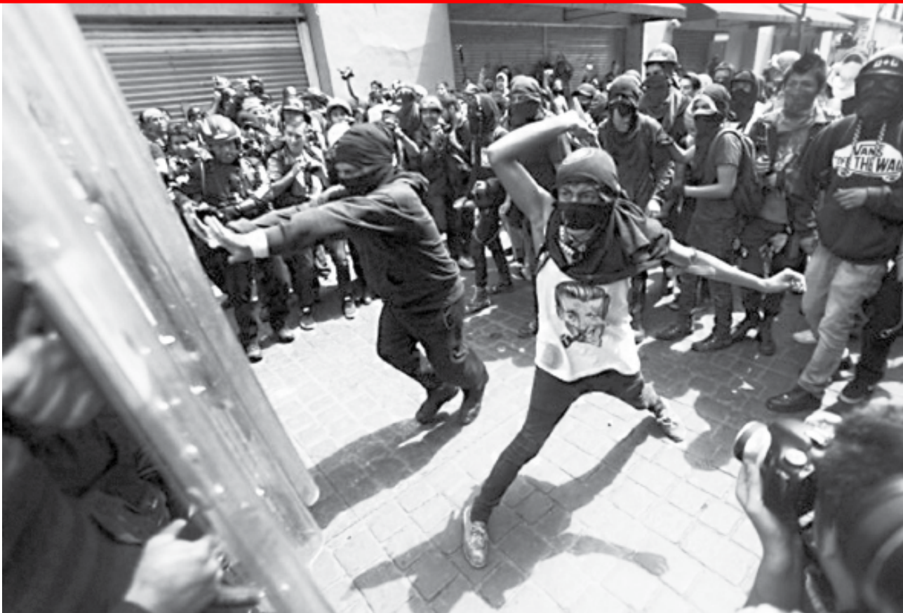
Protesters fight the police during a protest against President Nieto.

ruling class works. The capitalists disguise it as "democracy" and use their laws, ideology, and repressive apparatus to impose their interests on the working class. When that doesn't work, they resort to more open fascism — to military dictatorship and state terror.