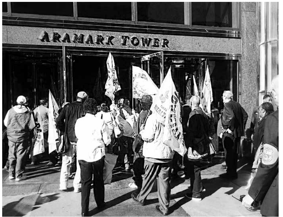
Workers storm into Aramark Headquarters, while dumbfounded security guards and administrators watch.

Trying to stop the Jefferson workers' march was the union leaders actually doing what they're supposed to do under capitalism: protect their positions as class collaborators, prevent us from seriously fighting the bosses' attacks, and blind us to the need for communist revolution.