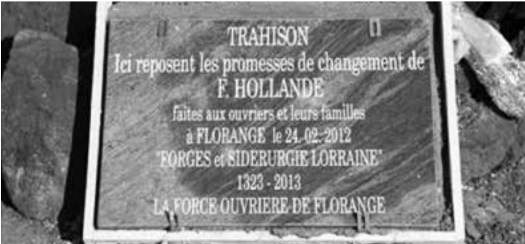
Gravestone that the bosses quickly removed from the Florange site after it was erected in April 2013. It reads: “Betrayal. Here lie the promises of change that F. Hollande made to the workers and their families in Florange on Feb. 24, 2012.”

Meanwhile, French bosses offered to lead an attack on Syria which workers in France roundly rejected. In France, like everywhere else in the world, the only solution to the ills of capitalism is communist revolution.✊