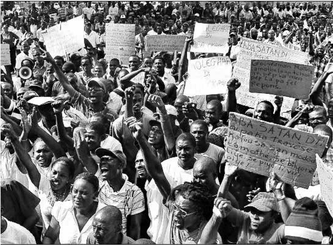
At a protest on May 31, 2013, workers in Haiti demand UN troops out. They carried signs reading, “Aba okipasyon” (Down with the occupation”).

To most Haitian workers, UN troops are an occupying army — even before it was discovered that the troops brought cholera to Haiti. Prior to 2010, Haiti had not seen a cholera outbreak for a hundred years! But when UN troops from Nepal were deployed to Haiti in the fall of 2010, they brought cholera with them. Nepal has an active cholera epidemic that was known prior to deployment, but the troops were not tested for it. They turned out to be carriers, if not actually sick. The waste matter from the camp leaked into the Artibonite River, which serves as a source of bathing, cooking and drinking water for the surrounding working class populations. Cholera has now infected more than 600,000 and killed more than 8,000, with the toll rising daily. Although the source of the cholera has been proven beyond a doubt (it is the same strain as the cholera in Nepal) and is even acknowledged by the UN’s own investigators, the organization denies that it owes any compensation for this devastating epidemic. The UN is hiding behind a stand-