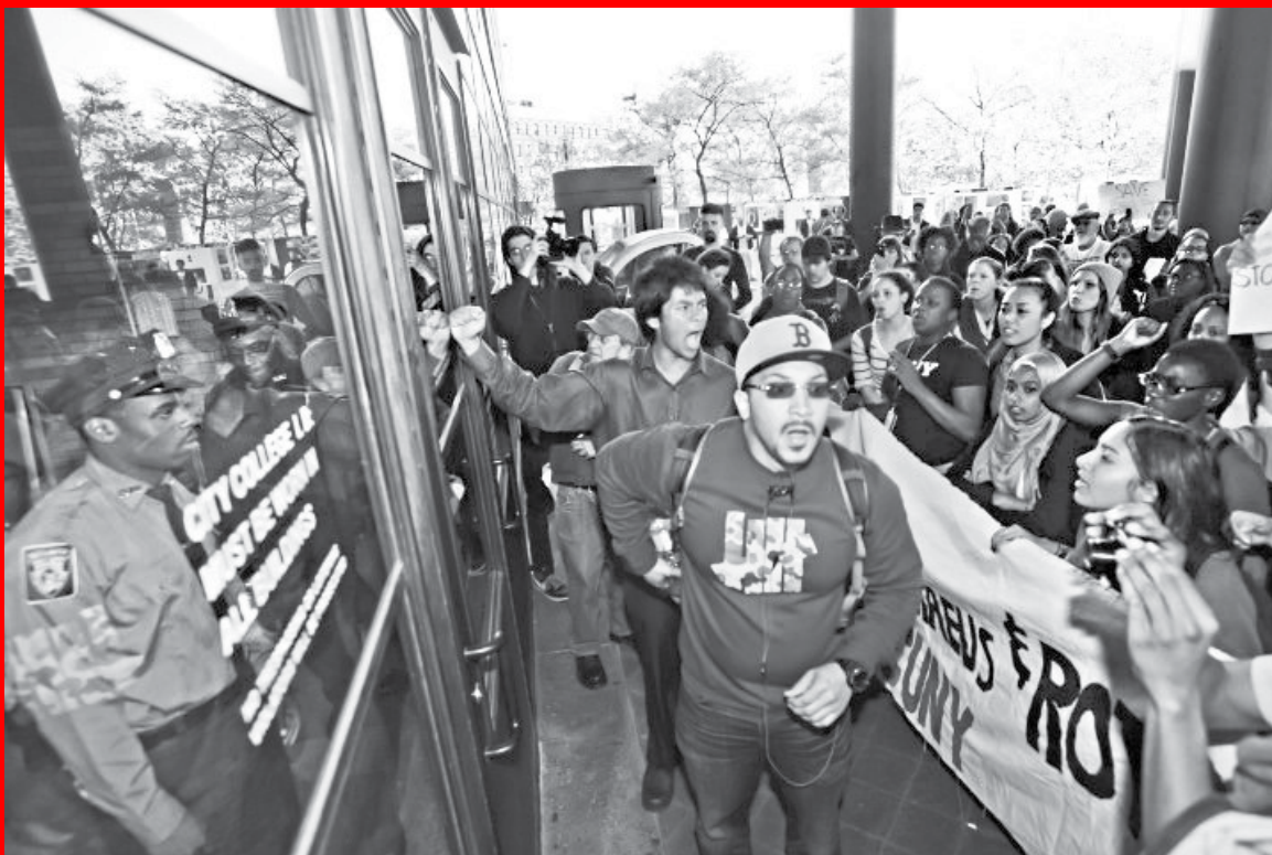
In response to the surge of anti-imperialist militancy of students and faculty, bosses shut down Morales-Shakur Center at City College. Hundreds protest. See page 3

brought to CUNY: the military needs to expand and diversify in preparation for future wars in the Middle East and Asia, where the U.S. plans to challenge the growing power of its Chinese rival (see page 2). CHALLENGE featuring numerous articles about the struggles at CUNY was also distributed. Our literature explained that colleges exist to serve the labor and ideological needs of the bosses to build an imperialist empire — through war research, military recruitment, patriotism, and of course, ROTC, which provides 30 percent of the military’s officers.