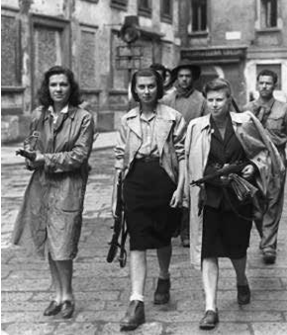
The Partisans, Italian Resistance movement, played a significant role in defeating Hitler's forces in Italy. These are partisans patrolling in Milan, 1945.

migrants from a number of countries or sterilize or kill those deemed unfit, such as those who were forced to commit petty crimes to survive or those with mental illnesses. The premise was that by selective marriage and breeding — backed by laws passed in many states — a master race could be developed that would rid the country of the elderly, weak and disempowered, and particularly the black, brown, and Jewish working class. In addition, immigrants from many countries were deemed inferior by this movement, including Irish, Italian, and Eastern European workers. Hitler's Holocaust was patterned on the eugenics movement, to which