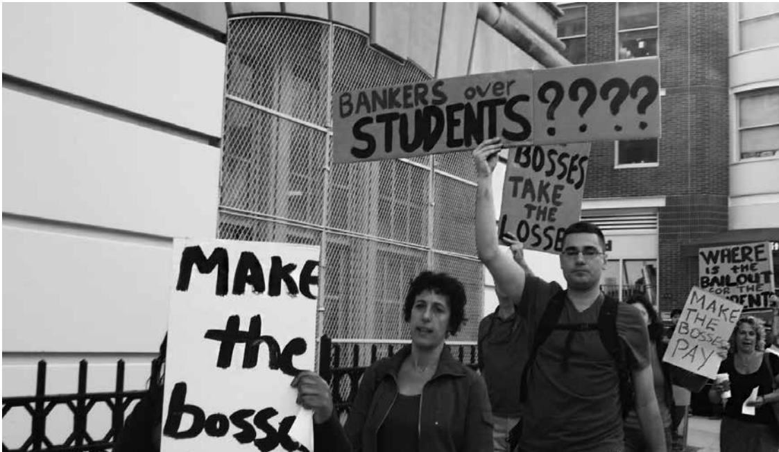
Teachers in brooklyn protest bosses’ racist education reform.

As the bosses’ economy continues to tank, one news report after the next warns that young people are entering the worst job market ever. This “new normal” of high unemployment and relentless attacks on salaries, benefits, and unions has teachers running scared as well. In hot pursuit is the main wing of the U.S ruling class. As these capitalists find themselves losing ground to their imperialist rivals, they are pushing for greater, more centralized control over what is being taught.