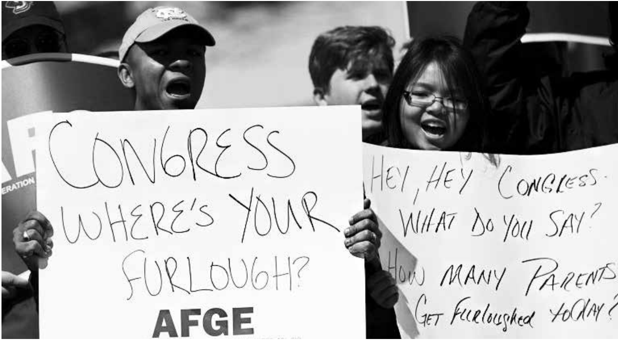
Federal workers protest government shutdown