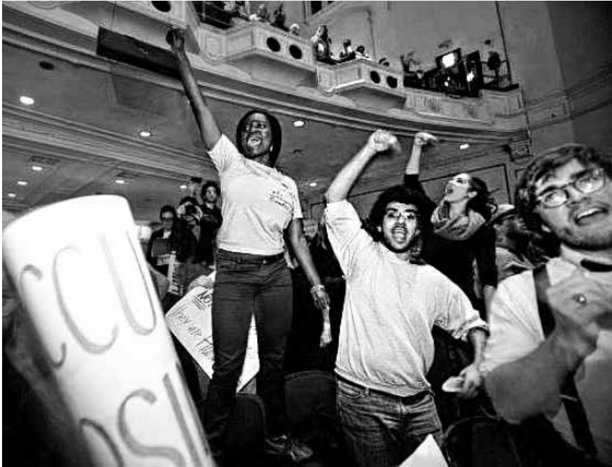
Students fight school closings

True critical thinking would lead to massive strikes and walkouts. We should aspire to this higher standard of learning and action. Yet the important teachers strike in Chicago last fall teaches us that we must aim for even more. A radical, militant, anti-racist alternative is desperately needed in battles against segregation and racist school closures in Chicago, New York, and throughout the U.S. The Progressive Labor Party is establishing a beachhead for bigger battles to come. Education workers, students and parents must fight tooth and nail against the Common Core and war budgets with our eye on the biggest prize. We must organize a movement for a working-class revolution. Our goal is to win the world our children — and theirs — deserve: a communist world.☺