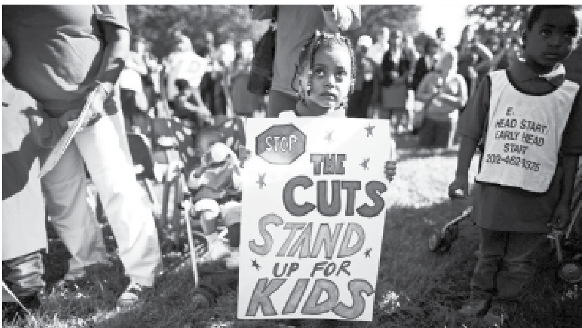
Working-class families protest outside the capitol building. The government closure denies assistance to thousands of children, infants and parents in need.

But despite their serious differences, all wings of both the Democratic and Republican parties wholeheartedly agree on one thing: escalating their attacks on the working class. While $3.5 million in salaries were shelled out to members of Congress during the first 13 days of the shutdown, the impact on workers was devastating. While the media blathered on about re-opening the Statue of Liberty and the national parks, racist and sexist cuts hit the Women Infants and Children (WIC) food program. These subsidies help sustain life for millions of babies, cared for by predominantly black and Latino mothers. At the same time, cuts in food