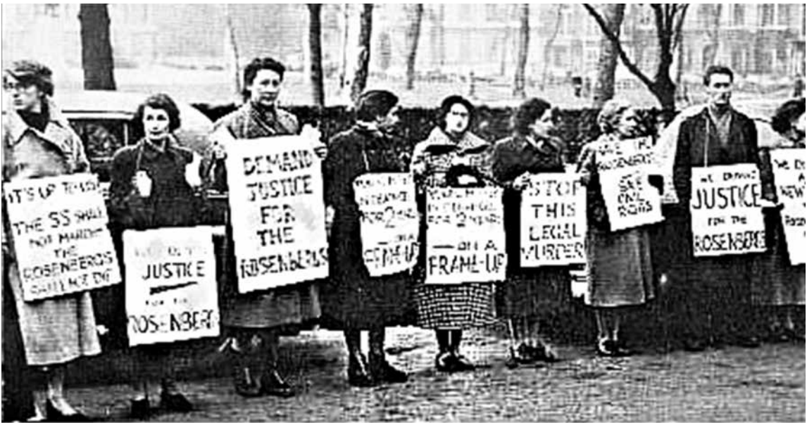
Communists in New York protest the legal murder of the Rosenbergs in 1953.