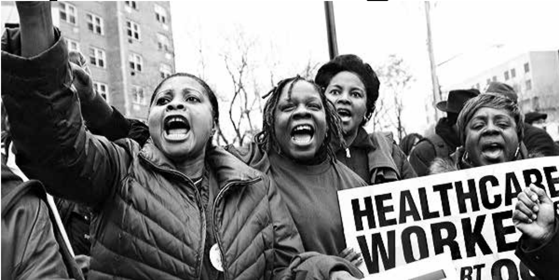
Brookdale Hospital workers and Occupy rally to oust the racist administration Mdysis and fight their healthcare cuts in November 2011.

At the frontline of this fight are women workers, most of whom are black and immigrant. Considering the sexist fact women bear most of, if not the sole, responsibility of raising children and taking care of their parents, we are at the forefront of the struggle for healthcare for our families. Those of us who may lose jobs at these