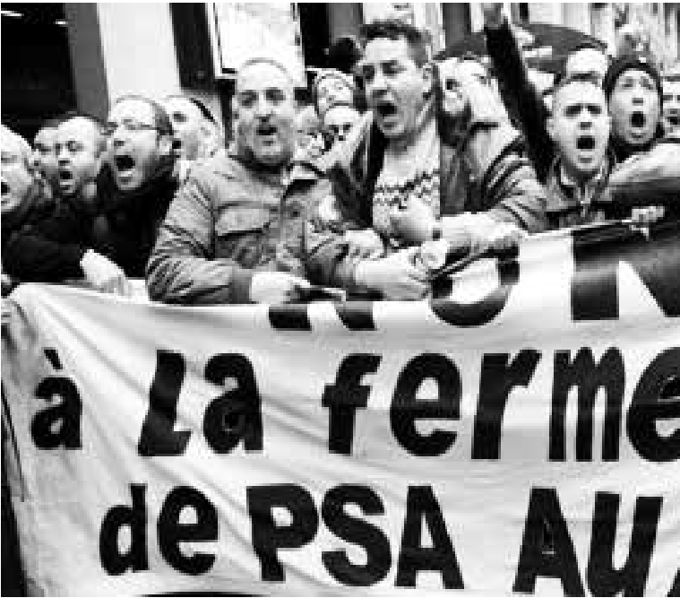
Workers protest closing of Peugeot plant

AULNAY-SOUS-BOIS, FRANCE, May 17 — The four-month strike of Peugeot workers against one of the richest and most powerful bosses in France ended today, unable to prevent the planned closing of the plant here, scheduled for 2014. The strikers received $1.1 million in donations, indicating enormous popular support, but were weakened by the fact that they could not widen the walkout to the rest of the company's factories nor to the country's auto industry. The strike cost Peugeot a production loss of 40,000 cars.