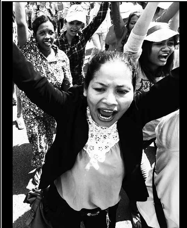
CAMBODIA MAY DAY

Why do local and national governments around the world permit such practices? In two words: class dictatorship. Some governments take the form of democracies, as in the U.S. and Bangladesh. Others are formally kingdoms, as in Saudi Arabia and Jordan, or capitalist states, as in China. But the content of all existing governments is the same — to maintain capitalist exploitation. That's why the Progressive Labor Party fights not for democracy, but for communism, a system without exploitation where the working class will rule.✪