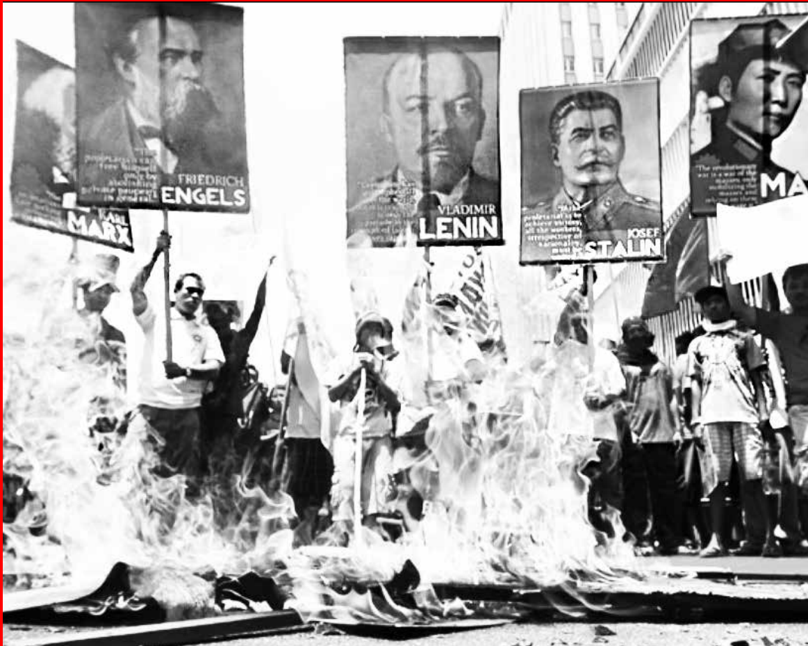
Philippines May Day