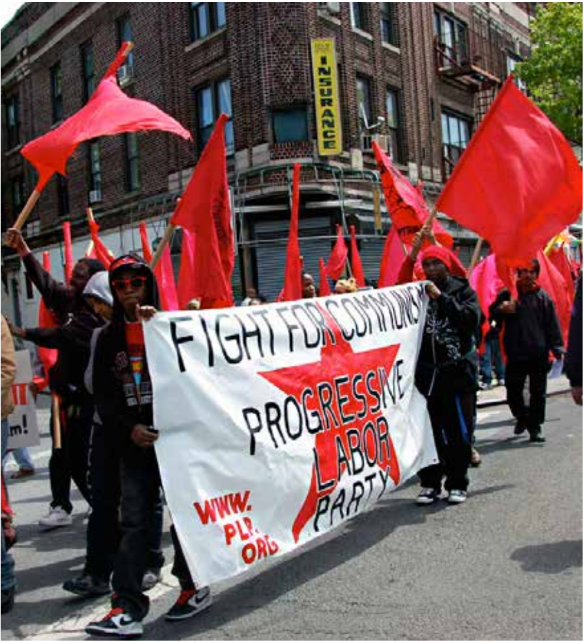
May Day in the United States

May Day is an exercise in this internationalism. In our anti-racist solidarity around campaigns against cholera in Haiti or in support of young rebels against NYPD murder in Brooklyn, NY, we are building a fighting foundation for the communist world workers want, deserve and will win.☺