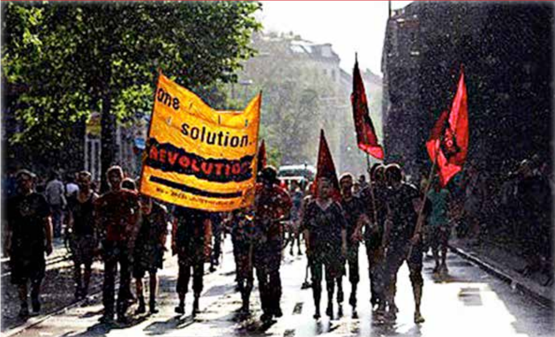
May Day in Berlin, Germany

At its core May Day means revolution, not reform. The future communist society which May Day embodies has been the aspiration of hundreds of millions — in truth billions — of working people in the past. This aspiration, distant though its fulfillment may be, nonetheless persists. The specter of communism Karl Marx wrote of in 1848 still haunts the capitalists and their rule.