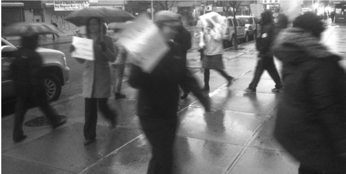
BROOKLYN, NY, January 16 — "What's disgusting? Union Busting!" chanted a group of teachers picketing in support of striking school bus drivers and matrons outside their school (see front page).