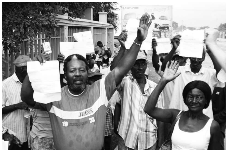
Haiti: Picket Lines, Health Clinic, Freedom School

Perhaps the most significant expressions of working-class fight-back were the upheavals in North Africa and the Middle East, collectively dubbed the Arab Spring, and in the Occupy Wall Street movement, a worldwide rage at the inequality of wealth that is the hallmark of capitalism.