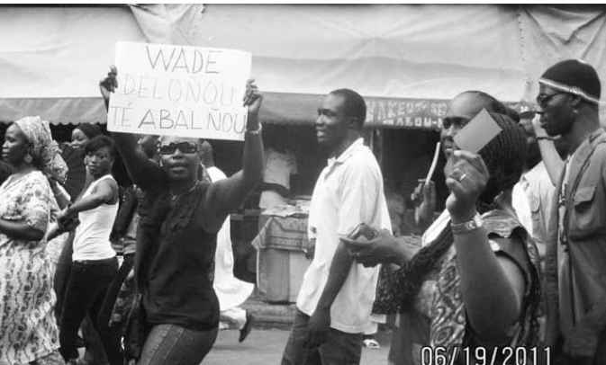
Red Ideas Take Root in West Africa

Nonetheless, the international working class proudly looked on as workers in Tahrir Square held up signs reading, "We are all Wisconsin," a reference to the 100,000-strong protest against the attack on public sector workers in that state. Months before anyone occupied a park near Wall Street, thousands of workers occupied the state capitol building in Madison, Wisconsin.