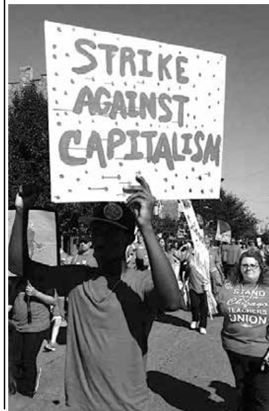
CHICAGO — 26,000 rank-and-file teachers went on strike! They defied the bosses, in fighting for better learning and working conditions. Everyday, teachers, along with students, picketed the system's 585 schools.