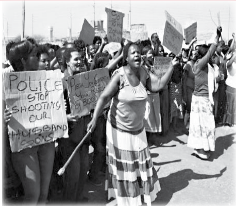
SOUTH AFRICA — Women protest ANC's government massacre of over 35 black miners on strike at the Marikana platinum mine.