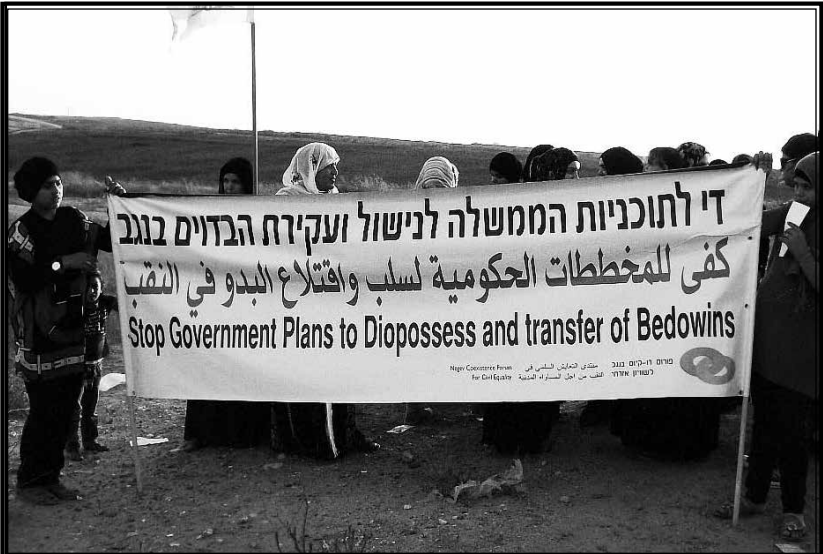
2012: International Class Struggle On The Rise ISRAEL-PALESTINE — Bedouin workers, both Arab and Jewish, fight Israel's racist eviction and its regime.

Capitalists care only for profits. The fiery death of hundreds of workers is only part of the super-exploitation of the working class. Only a communist revolution to smash the capitalist class can end this mass murder of workers. Until that day it's just a matter of time until the next big fire.☸