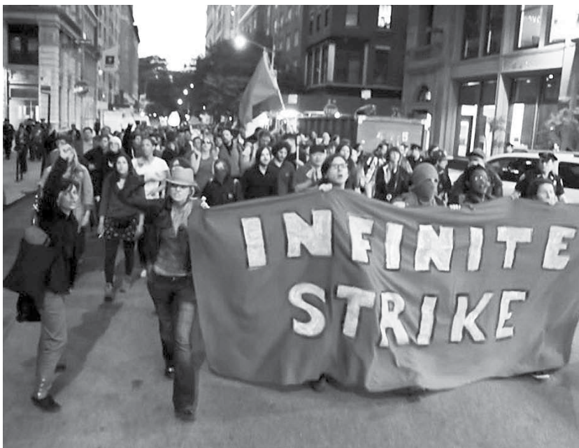
QUEBEC — 300,000 students go on strike against tuition hike and an unequal education system.