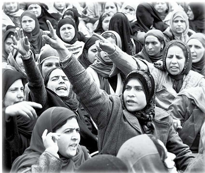
INDIA — Millions of workers went on a one-day strike in one of the largest walkouts in the country's history. They shut down transportation and banking.