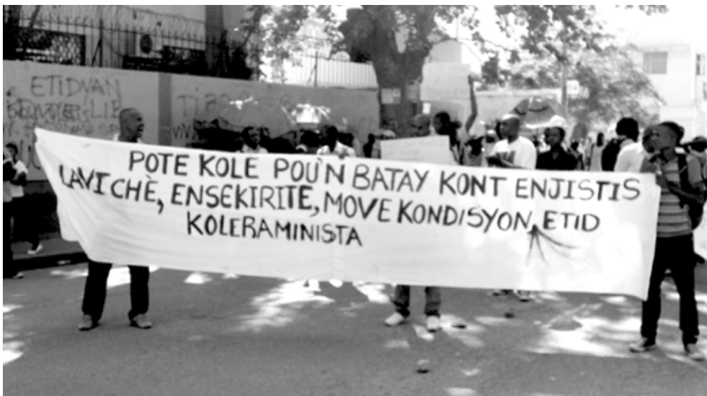
Students call on everyone to unite to fight against injustice, the rich, insecurity, poor study conditions, cholera, and the UN troops.

HAITI, December 7 — In three Haitian towns of St. Marc, Port-Au-Prince, and Gonaives, the spirit and the struggle of the November student demonstrations and national teachers' strike continues. In all three, students went on strike and marched—the banner in the picture declares the demands: "Unite and fight injustice, high cost of living, insecurity, poor learning conditions, and MINUSTAH troops and their cholera."