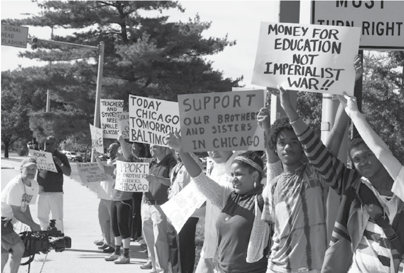
BALTIMORE — Students show solidarity with Chicago teachers on strike.