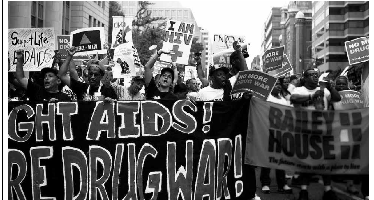
2012: International Class Struggle On The Rise WASHINGTON, DC — Several thousand workers and students from around the world marched to the White House, demanding end to the racist AIDS epidemic. We protested UPS and Wells Fargo en route.

spired our friends and family to get involved. The following week we took the leaflets to work and to school and continued the conversations about the need for workers to unite. As we head into the holiday season, we plan to continue raising issues of solidarity with Walmart workers here and those being exploited by capitalism around the world.