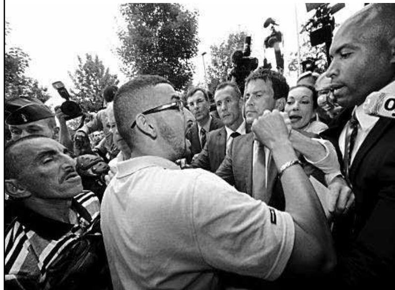
FRANCE — Workers rebelled against lack of jobs and cuts stemming from the continuing euro economic crisis. Pictured are residents attacking the French interior Minister when he came to quell workers' anger.