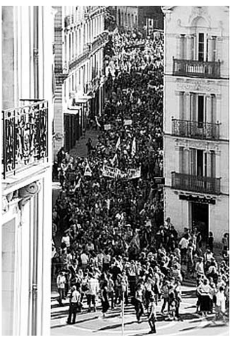
Teachers demonstration in Nantes.

PARIS, September 27 — Today, over 350,000 teachers struck and 165,000 demonstrated across France to fight mass layoffs, overcrowded classes and potential increases in working hours. Today's actions were notable because public and parochial school teachers were acting together for the first time. Historically, the two groups have been opposed. (Eighty percent of pupils attend public schools and 20% go to private schools, 95% of which are Catholic.)