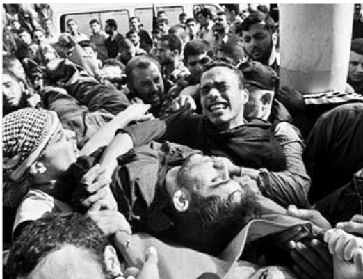
The Israeli-Palestinian conflict continues to pit worker against worker.

Despite the primitive and shocking conditions in most of Palestine, Israelis are largely unaware and/or unsympathetic. There is extremely potent racism against Arabs, who many Israelis see as sub-