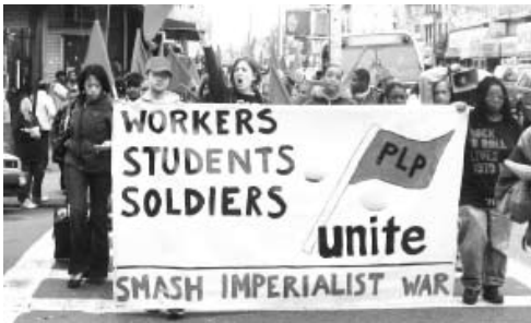
Fight Racism By Fighting FOR Communism!

With this event we've not only developed our leadership but also will be able to increase our