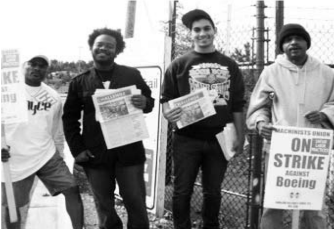
PLP members back Boeing strikers

They want to bail themselves out. But ultimately it's workers' loss of homes, jobs and health care, earning slave wages that would bail them out, in their drive to reindustrialize for war production to fight imperialist wars. The union wanted strikers to come into this battle blaming black, Latino and Chinese subcontractor workers. But when one seller held up our CHALLENGE strike Extra and shouted, "Read how L.A. subcontractor workers support Boeing strikers," she was cheered. Based on this experience, a Boeing CHALLENGE reader wrote a "thank you" note from us strikers to L.A. subcontractor workers who have sent support letters and spoken at some of our BBQs. It was the first political document he's written. He presented it to our group that meets at a nearby restaurant. He knew the union would stonewall any effort to build multi-racial, international unity between non-union subcontractors and us so he proposed a way to gather many rank-and-file signatures right now. Another shop steward agreed to sell more CHALLENGES after this discussion. Small, but useful, victories as the strike goes on. Holding the line while struggling to advance PLP's revolutionary communist line.. ⚡