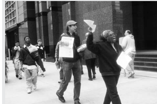
Chicago — Workers and PLP demonstrating outside Boeing offices

They want to bail themselves out. But ultimately it's workers' loss of homes, jobs and health care, earning slave wages that would bail them out, in their drive to reindustrialize for war production to fight imperialist wars. The union wanted strikers to come into this battle blaming black, Latino and Chinese subcontractor workers. But when one seller held up our CHALLENGE strike Extra and shouted, "Read how L.A. subcontractor workers support Boeing strikers," she was cheered. Based on this experience, a Boeing CHALLENGE reader wrote a "thank you" note from us strikers to L.A. subcontractor workers who have sent support letters and spoken at some of our BBQs. It was the first political document he's written. He presented it to our group that meets at a nearby restaurant. He knew the union would stonewall any effort to build multi-racial, international unity between non-union subcontractors and us so he proposed a way to gather many rank-and-file signatures right now. Another shop steward agreed to sell more CHALLENGES after this discussion. Small, but useful, victories as the strike goes on. Holding the line while struggling to advance PLP's revolutionary communist line.. ⚡