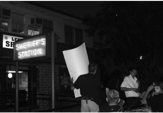
PICKET LINE IN FRONT OF KKKOP STATION

The most important lesson we learned is that we should never underestimate our class. Our initial hesitation to be militant at a vigil based on the fear of being seen as "opportunist" (taking advantage of the situation) was wrong. The actions of the working class in Lennox and especially some of the Portillo family members reminded PL'ers of the responsibility they have to build the fight for communism. PLP made contacts here and will continue to build the relationships needed for the long-term fight for revolution! Only revolution will end these brutal police murders and the terror that is capitalism! ☸