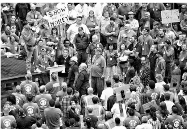
Boeing Workers ready for action

The tactics may differ, but in the end, aerospace workers will suffer the same fate as their class brothers and sisters in auto and other industries. More work will be subcontracted to the non-union shops; union workers will face lay-offs or lower pay in the current plants. We must