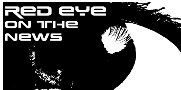
Below are excerpts from mainstream newspapers that may be of use for our readers. Abbreviations: NYT=New York Times, GW=Guardian Weekly, LAT=Los Angeles Times

The open fascists know they can get a better deal for themselves by negotiating directly with Brazil's Petrobras, BP, Spain's and Argentina's Repsol and other energy giants. Workers and their allies must also reorganize and build on their struggles to turn them into schools for communism: to eliminate all forms of capitalism and its fascist-racist goons. 🌐