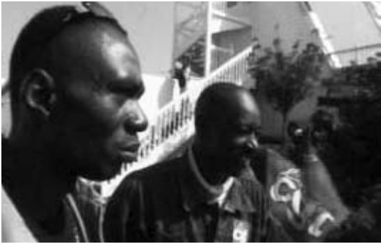
Striking restaurant workers in Paris

So Sarkozy and Hortefeux are counting on anti-immigrant racism to strengthen right-wing support for the government. The result is a case like that of "Mr. G." In January he went to the prefecture in Melun to file for legalization. The clerk handed him a form to fill out and within five minutes the cops put him in a detention center on a just-issued deportation order! Another case is that of Baba Traore from Mali, who leaped into the Marne River on April 4 to escape the immigration police. He died of im-