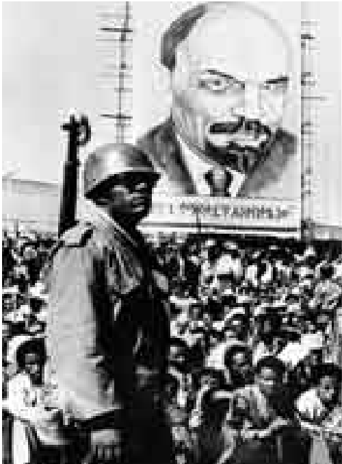
Cuban Troops in Angola

fighting for Namibian independence from South African control. The border war's final battle occurred in the city of Cuito Cuanavale, in early 1988. It involved hundreds of tanks, artillery, planes and 50,000 Cuban-army-led soldiers against the UNITA-South African army attempt to capture the city. Both sides suffered heavy casualties. The apartheid regime claimed it wasn't defeated. But as von Clausewitz said, "war is the continuation of politics by other means." That battle crushed the myth of invincibility of the racist apartheid regime and its army. Several years later, apartheid was dismantled in South Africa. Unfortunately, this defeat of the hated apartheid regime didn't include a revolutionary struggle against the root of racism: capitalism. Today, the rulers of South Africa, Angola and Namibia (all former leaders of those liberation movements) are in bed with capitalism and imperialism. Cuba looks to be turning towards the "China" road of free-market capitalism. And a new imperialist battle for Africa's oil and other vital resources is developing, now between the U.S. and Chinese imperialists. A luta continua (the struggle continues).