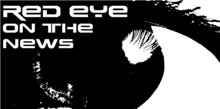
Below are excerpts from mainstream newspapers that may be of use for our readers. Abbreviations: NYT=New York Times, GW=Guardian Weekly, LAT=Los Angeles Times