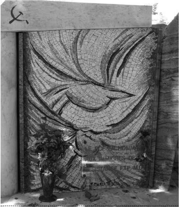
A memorial to the fighters of the FTP-MOI at the Pere Lachaise cemetery in Paris

This great historical example of armed struggle against fascism should give us optimism for our current struggles against the ruling class. Even during one of the darkest periods for communists and the