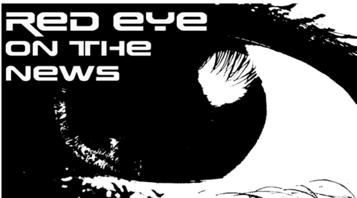
Below are excerpts from mainstream newspapers that may be of use for our readers. Abbreviations: NYT=New York Times, GW=Guardian Weekly, LAT=Los Angeles Times

We in PLP believe that a divided working class is the best weapon the bosses have to make ALL workers pay for their crisis and wars. Now more than ever, our slogan must be, "Same enemy, same fight, workers of the world, unite. ☺