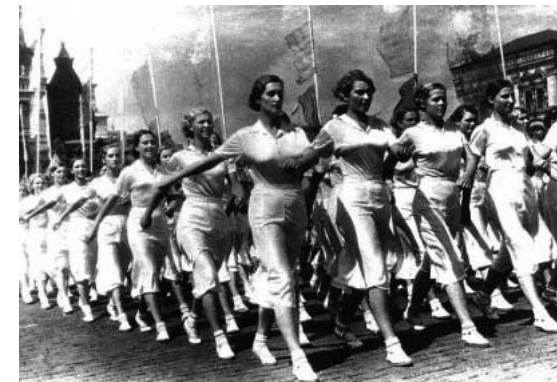
Soviet women marching in the 1930s

When the Russian Revolution, and the Civil War that followed it, ended in 1921, the new workers' state was in a state of exhaustion: largely destroyed, several million of its citizens killed, with a raging famine. Millions of homeless people wandered the land, and starvation was rampant. The worldwide typhus epidemic of 1919 had killed tens of thousands.