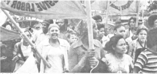
Anti-fascist members and friends of PLP and C.A.R. tell off ROAR racists in Queens, N.Y.

However, the red-baiting proved a complete fiasco. The task force of "special prosecutors" vanished as suddenly as it had appeared, without producing a single prosecution. Boston's workers didn't fall for the red-baiting. The organized fascist forces failed to grow during the weeks after Carson Beach. Meanwhile, thousands of people throughout greater Boston continued to sign the INCAR petition.