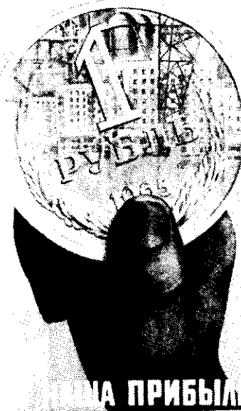
The "Communist" Party's Line: Profits Bring Socialism.