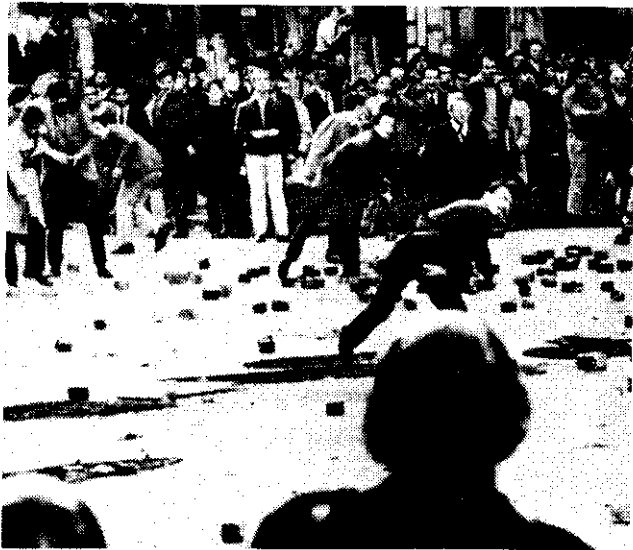
Students Hurl Bricks at Cops.

centage of degree candidates from the job market, etc.