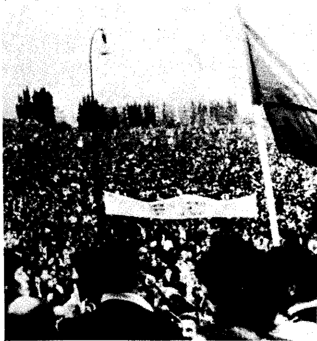
Mass Rally of Workers and Students, May 27, 1968.

When soldiers were called up to help the Paris sanitation department clean the streets after the battles of the Latin Quarter, they frequently fraternized with the students. Army trucks carrying draftees were even observed driving through the capital flying red flags.