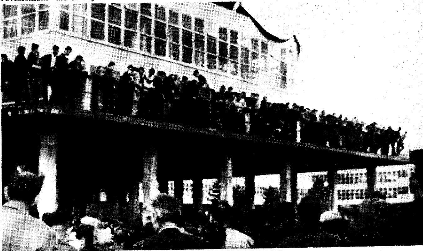
May 16, 1968: Renault Workers at Flins Raise Red Flag over Occupied Factory.

Collective authorship: Notre Arme C'est la Grève; La Grève chez Renault-Cléon ; Francois Maspéro; Paris; 1968.