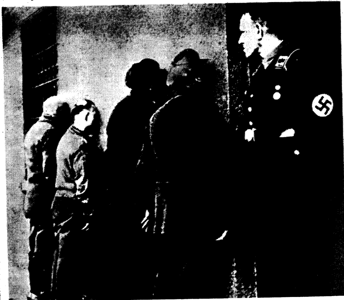
One result of eugenics....

Philosophers also joined the ranks. Martin Heidegger chimed in with his own praises of